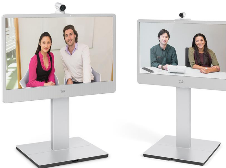
Figure 1. Cisco TelePresence MX300 G2 and MX200 G2

Cisco MX300 G2 and MX200 G2 systems are as easy to install as a television, and can be set up in about 10 minutes. They're priced for large-scale deployment, so you can quickly and easily transform any meeting space into a telepresence-enabled team room. The MX300 G2 with a 55-inch screen is ideal for medium size rooms. The MX200 G2 has a 42-inch screen that makes it ideal for small-to-medium rooms as it has a wide field of view for tight spaces. Both products are easy to use and affordable enough to make video collaboration possible throughout your organization.