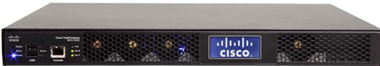
Figure 2. Cisco TelePresence MCU 5300 Series Is Standards-Based and Compatible with All Major Vendors' Endpoints